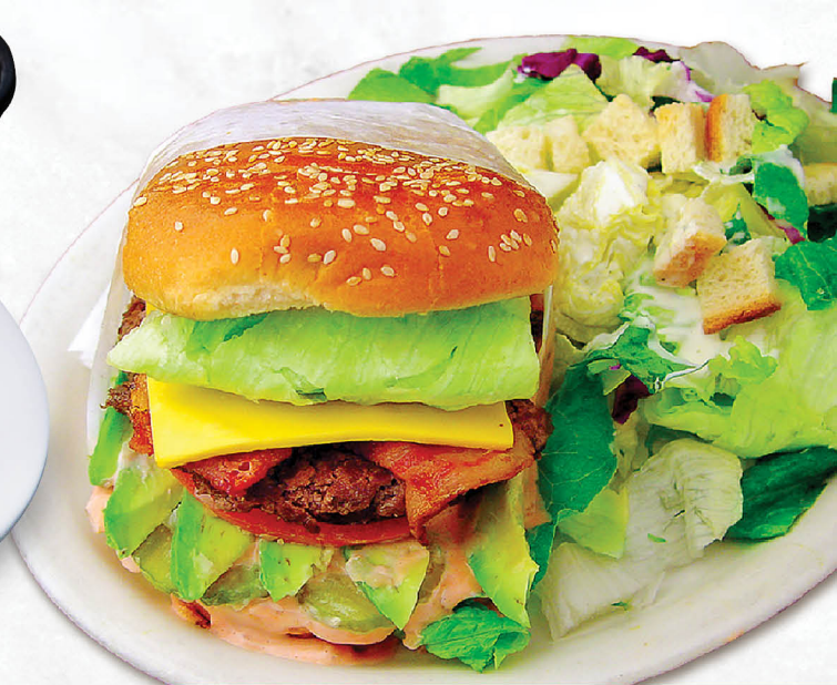
Bacon Avocado Cheeseburger