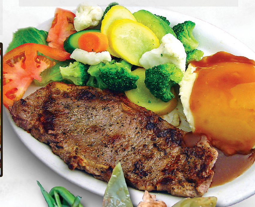
New York Steak