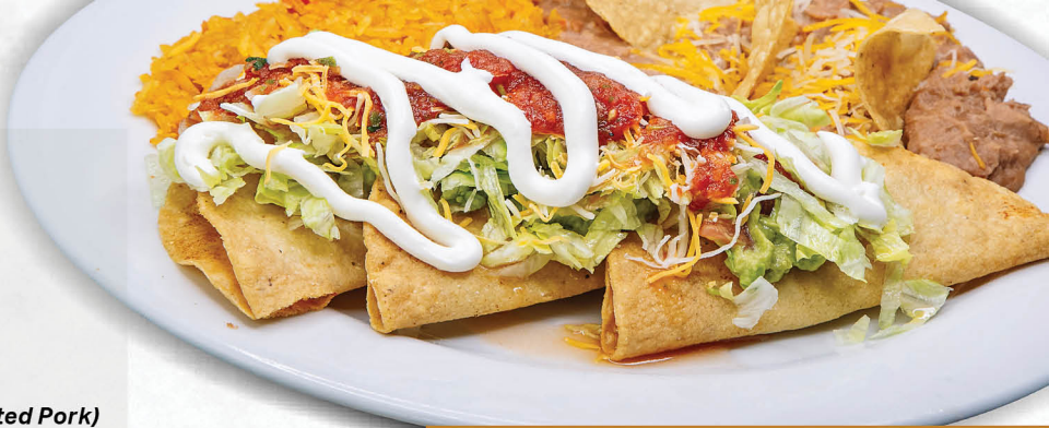
Hard Shell Tacos

Served with guacamole, lettuce, cheese, salsa and sour cream. One choice of meat only.