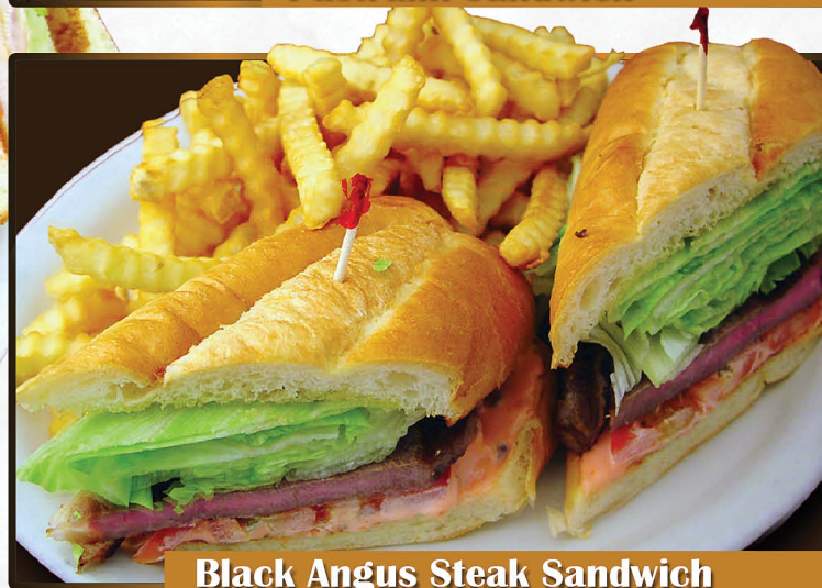
Black Angus Steak Sandwich