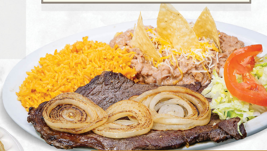
Carne Asada with Onions