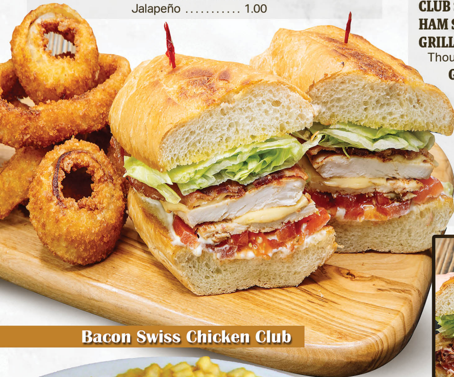
Bacon Swiss Chicken Club