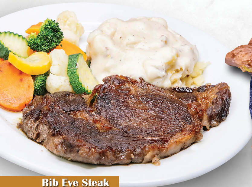
Rib Eye Steak